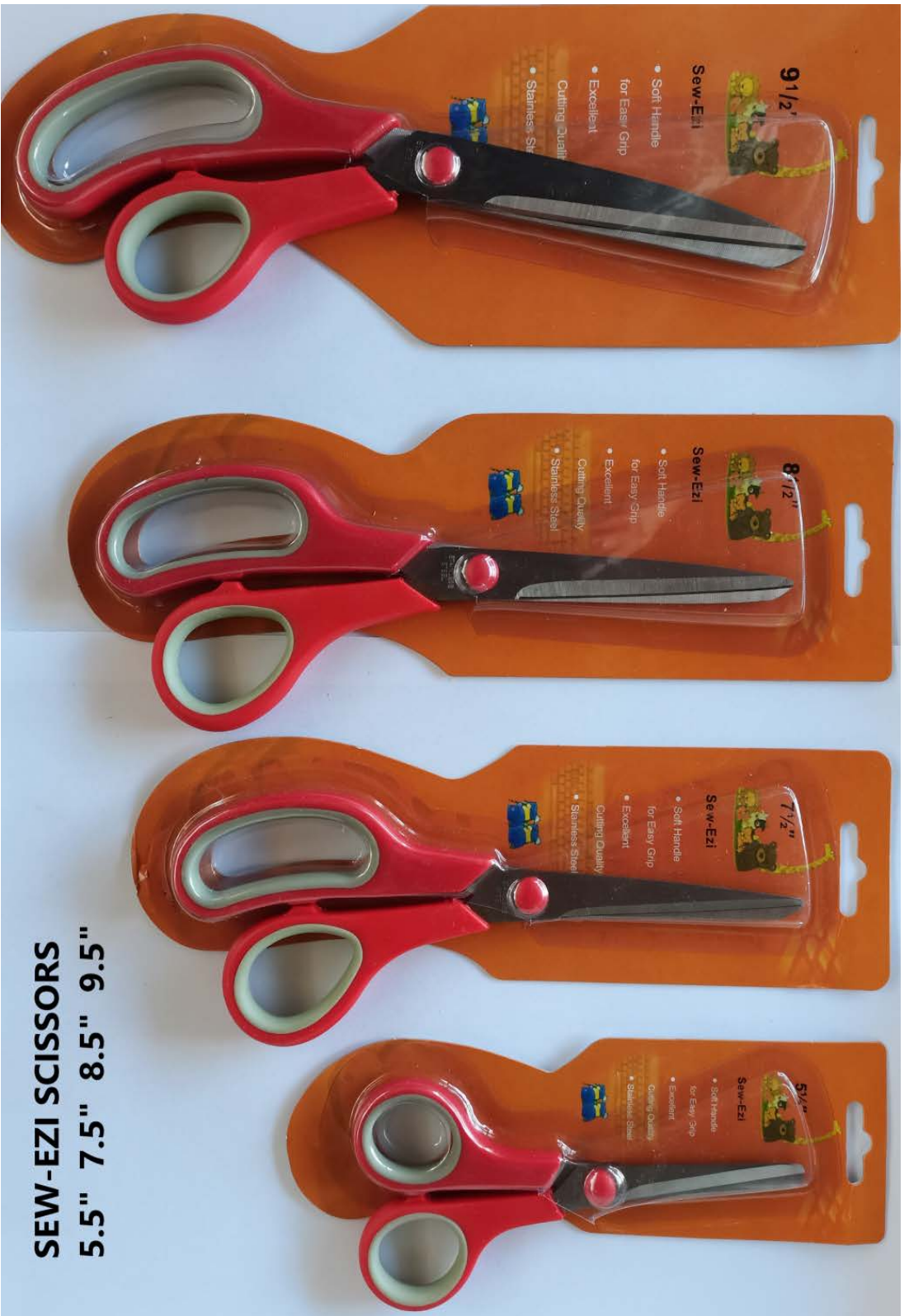
SEW-EZI SCISSORS 5.5" 7.5" 8.5" 9.5"