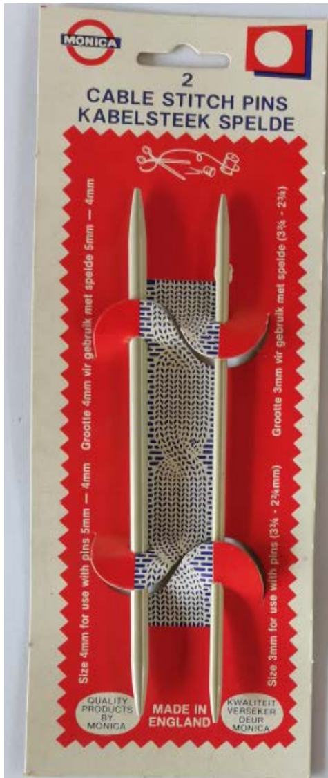
Cable stitch Pins