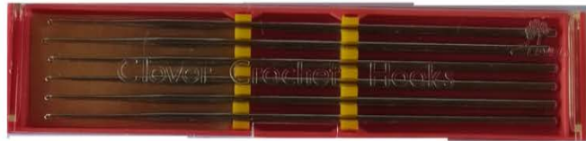
Clover crochet hooks Size 1.25mm