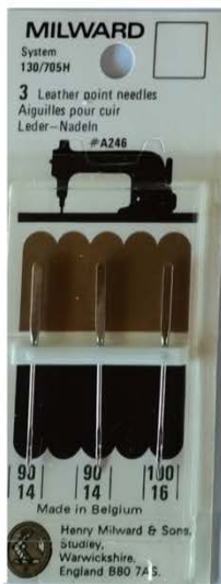
Leather point needles