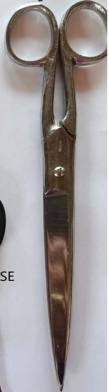
PAPER SCISSOR 9"